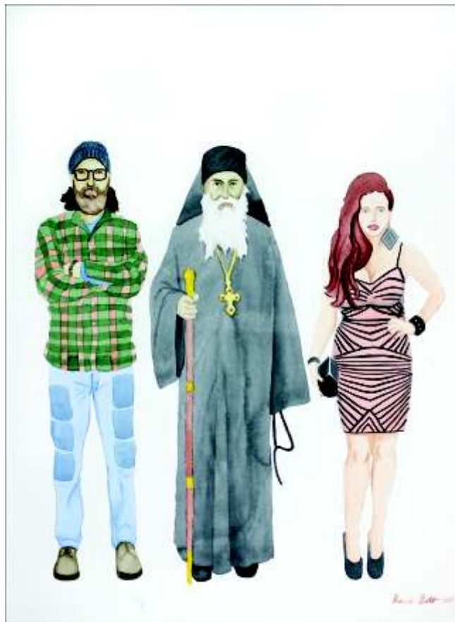
#1 / Group photo #1, / watercolour, 77x56cm, 2013 ( /pg 11 /left)