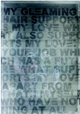
Slavoj Žižek, "Elfride Jelinek, / quote from a novel "Women like lovers" Elfride Jelinek, white oil marker on a foil and watercolor, 77x55,5 cm, 2013