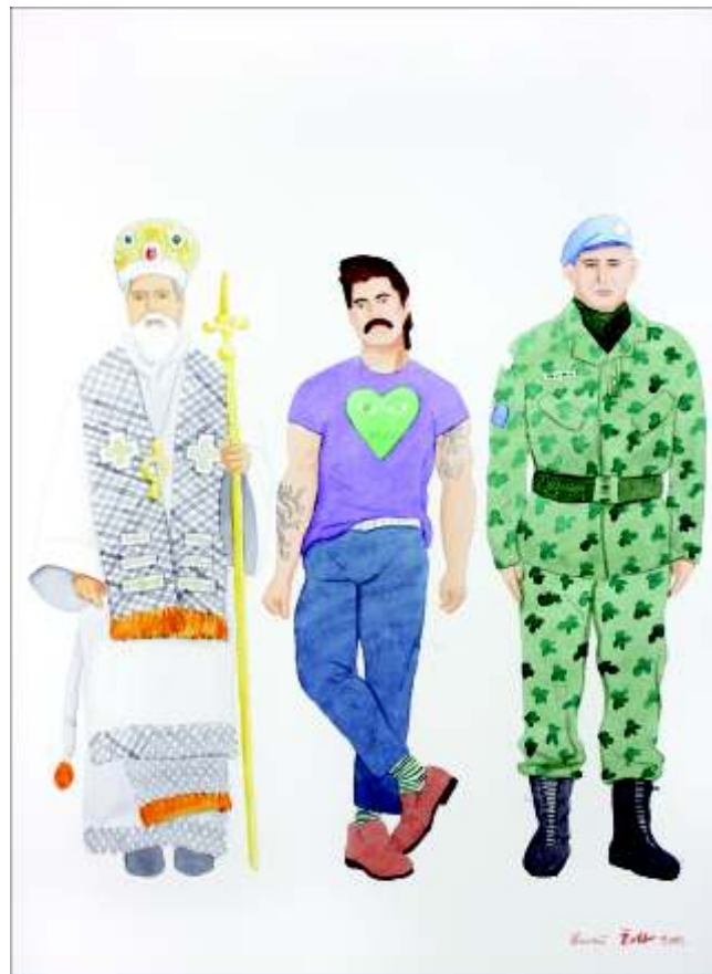
#2 / Group photo #2, / watercolour, 77x56cm, 2013 ( /pg 11 /right)